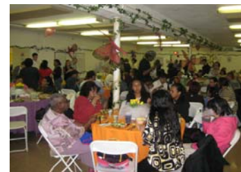
Guests enjoying the festivities