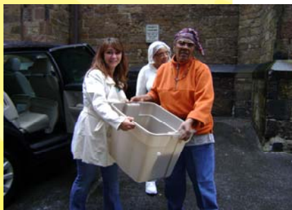
HOPEsudbury representative and a WLP Guest unloading donations

This spring members from HOPEsudbury made a special connection to the staff and guests at the Women's Lunch Place. After taking initiative to reach out to local non-profits, HOPEsudbury organizers orchestrated a