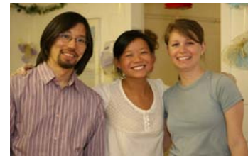
Mother's Day Volunteers

2009 Mother's Day Card Campaign was made possible by the generosity of Boston Properties, Robins, Kaplan, Miller & Ciresi L.L.P, St. Cecilia's Parish, and the countless volunteer groups who kept our kiosk sales thriving. Thank you for all of your support and dedication!